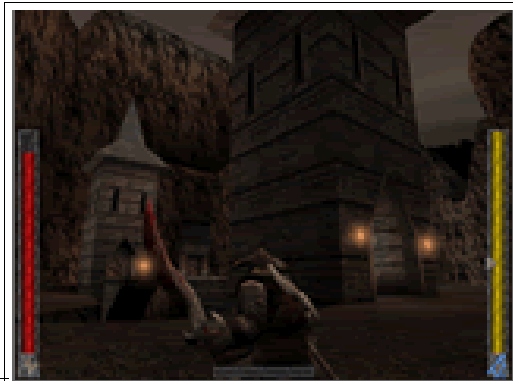
Axes. Hammers. Swords. Horns. Rune.

Quake 3 1.30 patch, includes new automatic update mechanism and anti-cheating measures. www.idsoftware.com